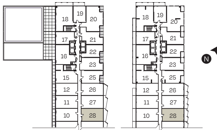
LEVEL 03 & 04