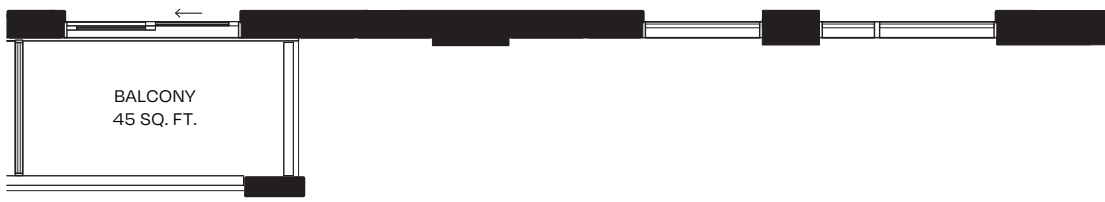
BALCONY AT LEVEL 10-23